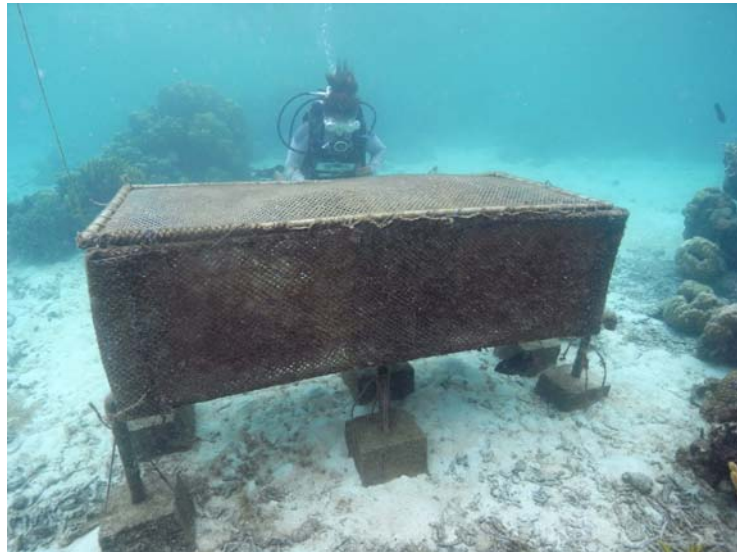
Sea cage in the Tun Sakaran Marine Park containing juvenile giant clams

Abalone are normally reared in barrels suspended on long lines, with about 2,000 abalone in each barrel and 2 barrels taking up 1m 2 (McShane 1997). Abalone have to be fed with algae, and the organic wastes produced are known to be comparable to the amounts documented for intensive salmon culture (McShane, 1997). Intensive farming would involve 50 or more barrels, but for TSMP communities, 3 or 4 barrels would be sufficient to bring in a good income. There has been no noticeable impact on the back reef habitat where the broodstock are currently being maintained close to the jetty at Boheydulang in an enclosure about 3m x 2m in size.