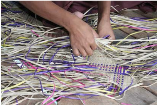
Production of mats at Kg Boheybual, Tun Sakaran Marine Park

front cover) are large and would be too bulky for many visitors to consider buying. They are also quite expensive due to the fact that each one requires months to make. One mat (full colour) roughly 1.5m x 2m takes one lady about 2 weeks to produce and involves an outlay cost of at least RM20-30 for materials (dyes and pandanus leaves). The price asked by the Bajau Laut is about RM 350 (£80) which is more than many visitors would want to pay, even though it is more than justified given the amount of time involved in its creation.