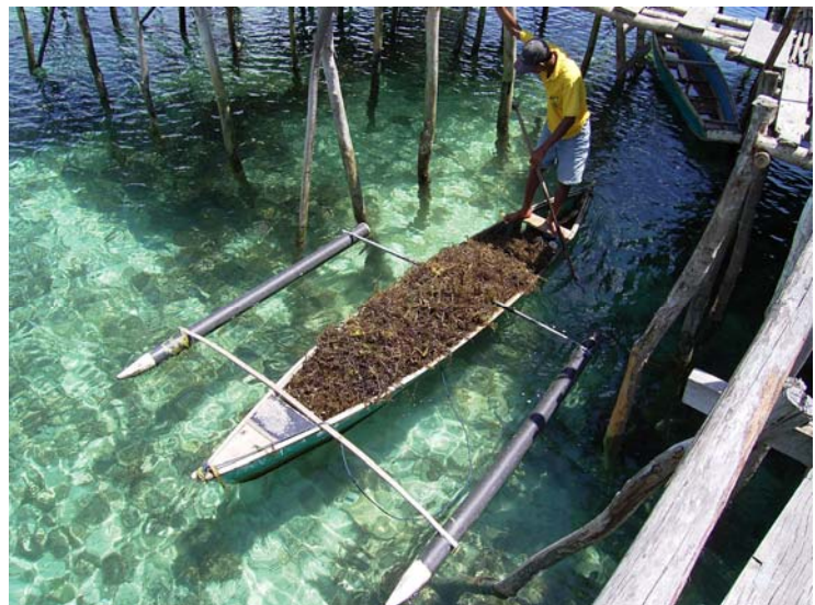
Seaweed farming in Tun Sakaran Marine Park

Other opportunities lie in existing and planned mariculture operations. Seaweed culture has been established for decades and has expanded in recent years because of high market prices and relatively low entry costs. Culture and farming of marine invertebrates also has potential, and development within this sector was the second theme within the alternative livelihoods part of the current Darwin project. Progress on this is described in Section 3.