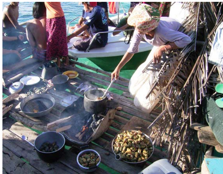
Bajau Laut community in Tun Sakaran Marine Park, preparing locally-caught fish and shellfish

As part of the endeavour to encourage alternative livelihoods within the tourism sector, the Semporna Islands Darwin Project looked more closely at two possible activities that had been flagged up by the local community - Homestay and Craftwork. These are discussed in the following sections.