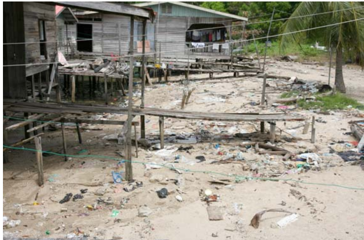
Pulau Selakan currently has a problem with rubbish and its disposal

In order for Homestay at Selakan to become a reality there need to be significant improvements to the infrastructure on the island, including sewage treatment (proper flushing toilets and septic tanks) and repairs to the wooden jetty. There would also have to be a major rubbish clean up on the island and a strategy implemented for proper rubbish disposal in the future. Boats and boat drivers also have to be licensed in accordance with Sabah state regulations.