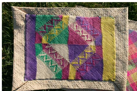
Place-mat sized mats made during the SIDP trial.

Other handicrafts that were mentioned during the workshop such as carvings and souvenirs made from wood, coconut shell, bamboo, marine shells and recyclable materials such as plastic all have potential. However, investment and training would be needed to ensure that any initiatives undertaken were sustainable and had a good chance of success.