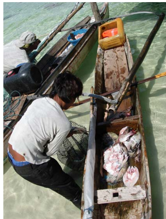
Fisherman bringing in catch in Tun Sakaran Marine Park

The focus for the alternative livelihood programme in the Park therefore needs either to be directly with the Bajau Laut and/or fish dealers or with other communities who might open up job opportunities for the fishing community.