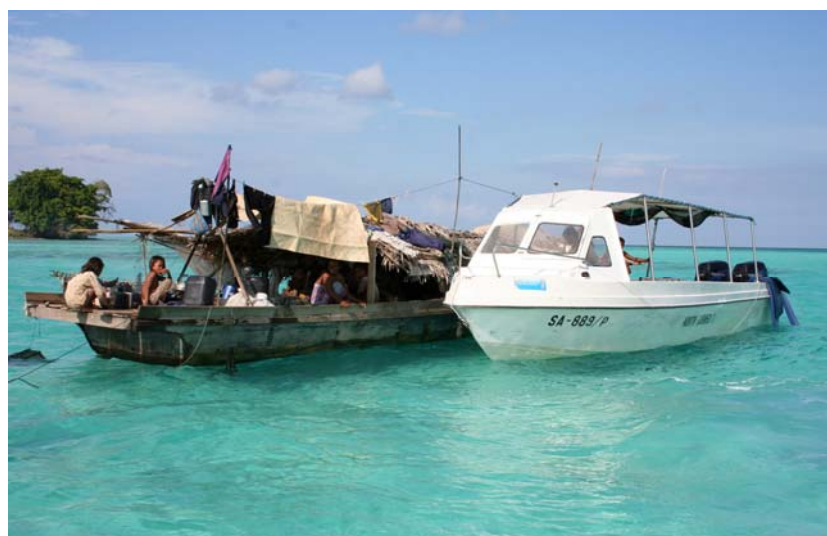
Visitors and Bajau Laut interacting in the Tun Sakaran Marine Park

All the families interviewed said that they welcomed the potential of having tourists visiting their village and would allow visitors in their house as long as they did not create problems and the families received remuneration. The Bajau Laut also commented that TV Companies make lots of money from filming their culture and it would be fair that they also receive a share of these profits.