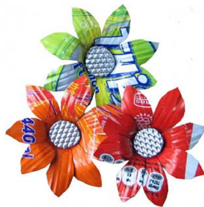
Recycled metal daisies made from drink cans - an example of how waste items can be used to make saleable items

Waste materials such as plastics and aluminium drink cans are in plentiful supply and there is considerable scope for the local community to use these freely available materials to make items such as jewellery, souvenirs and toys. One of the main complaints made by visitors to the Park is about the amount of litter on the islands and in the sea, so it is likely they would support an initiative that put some of the waste to good use.